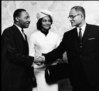
Dr. Martin Luther King, Mrs. King, and Dr. Ralph Bunche at the UN headquarters United Nations, NY, December 4, 1964